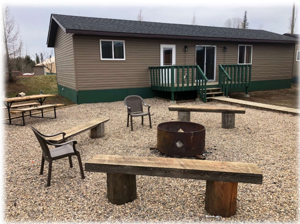
Social Fire Pit Area

Vista Ridge is seeking full-time seasonal staff and it is expected staff will, at least, complete one Winter or Summer season. There will be opportunity to work into the next season for the right candidates.