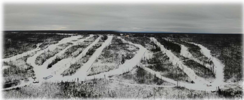
Ski Area (Drone shot)

Winter Season: Late November to Early April Activities: Skiing/Snowboarding, Snow Tubing, Cross Country Skiing, Snowshoeing, Ice Skating