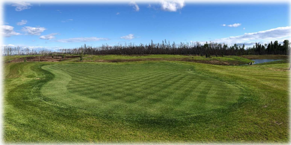
Green on Hole #2