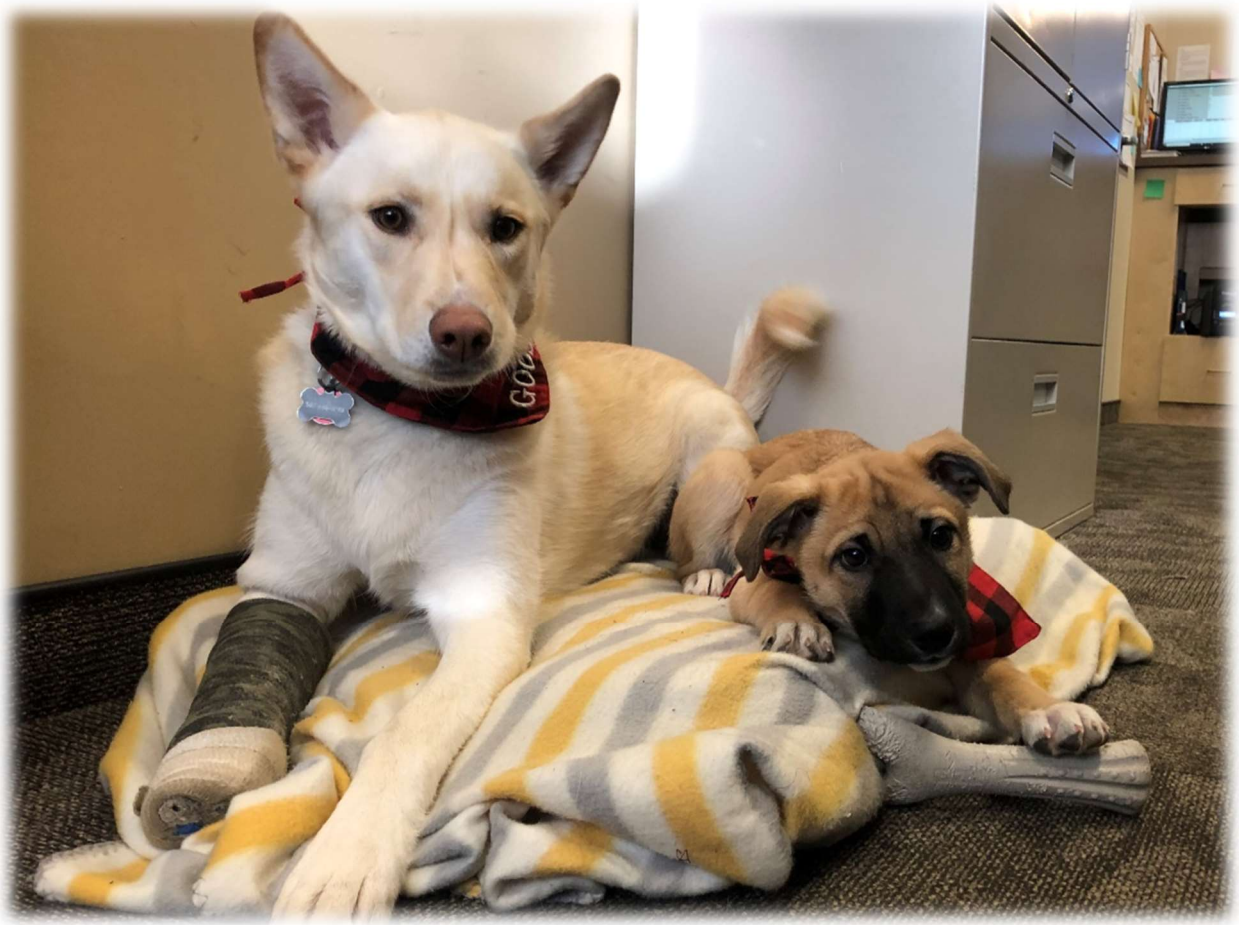
We can't forget our two resident fur staff Goose & Roman!