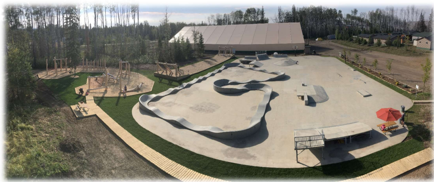
Skatepark/Pumptrack & Playground