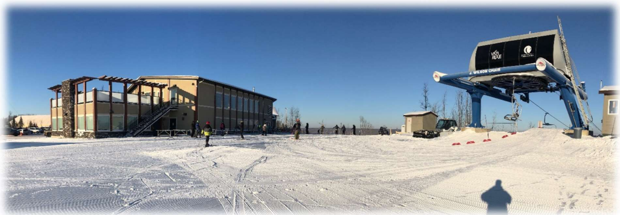
Base Area (Main Lodge & Wilson Chair)

Flights to Fort McMurray are available from all major Canadian centres, (Vancouver, Calgary, Edmonton, and Toronto). Vista Ridge staff will be at the airport or bus station to pick you up.