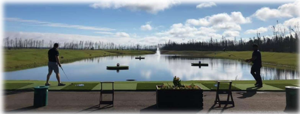
Aqua Driving Range

Aerial Park, Mini-Putt, Skatepark/Pump track, Frisbee Golf, 12-Hole Golf Course & Aqua Driving Range