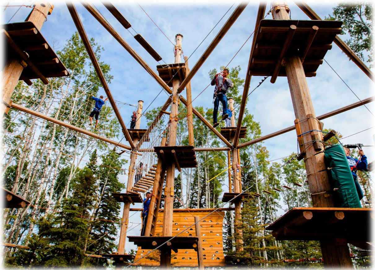
Summer Aerial Park